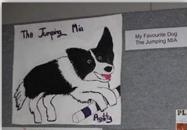
Awarded a Sash in the class