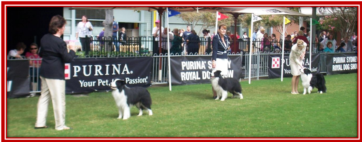
Left to Right: Gr Ch Nahrof More Than Words H.I.T. - Gr Ch Nahrof Enough Said E.T - Dalheath Midnight Sun

As printed in DOG NEWS Australia, May 2010 edition, page 69.