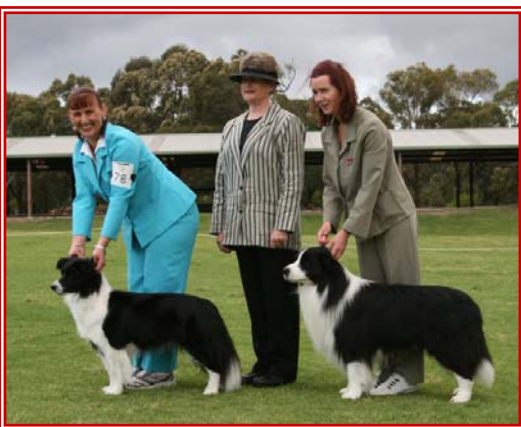
Ch Syryne Vega O Lyrae PT - Ch Danari Danceth Waves

Another strong class of lovely quality bitches.