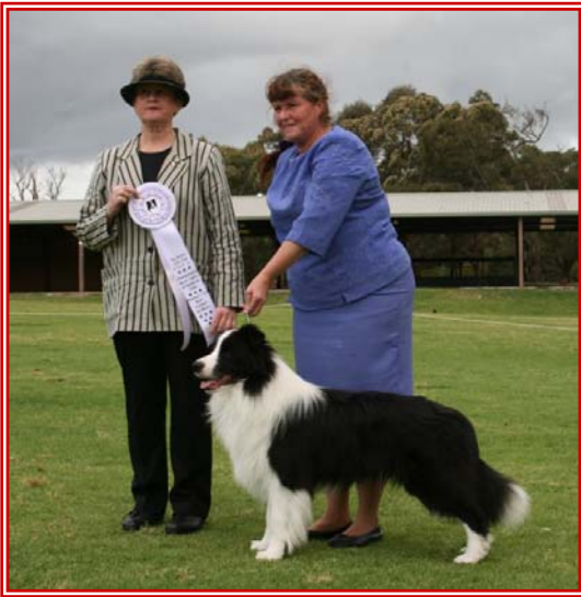
Ch. Bordalace Flash N Dash HT

1 st CH. BORDALACE FLASH N DASH HT – A. Cowin Well presented, 2 year old black and white masculine boy of excellent breed type and good size. Perfect balance, displaying gracefulness and a smooth outline on the profile. Strong head proportions, good width between ears, correct eye shape, dark in colour with mild expression and eagerness to please his handler. Good length of neck into well angulated forequarter and depth of chest. Strong bone, good flex in pasterns and oval feet. Good spring of rib and body length, gentle slope to croup and good set on of tail with an upward swirl. Well turned and width through stifles, short thick hocks. When he settled on the move and pushed his head out and forward, carrying it in line with his top line or slightly higher, he displayed a lovely ground covering action with excellent reach and hind drive. From all angles he moved soundly. I could imagine him working all day. Really liked this boy and was very pleased to award him the class, DOG CHALLENGE, RUNNER UP BEST IN SHOW and BEST OPPOSITE SEX INTERMEDIATE IN SHOW in a very close contest with the bitch.