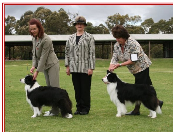
Ch Danari Drama Queen - Grd Ch Nahrof More Than Words HIT

Lovely strong type. Good head proportions, strong bone. Good length of neck into well angled forequarter, good depth of chest, and good spring of rib. Good body length with well turned stifles and short hocks. Shown in lovely coat condition. Sound coming and going and lovely ground covering side gait. It was my pleasure to award her the class and also BEST OPEN IN SHOW.