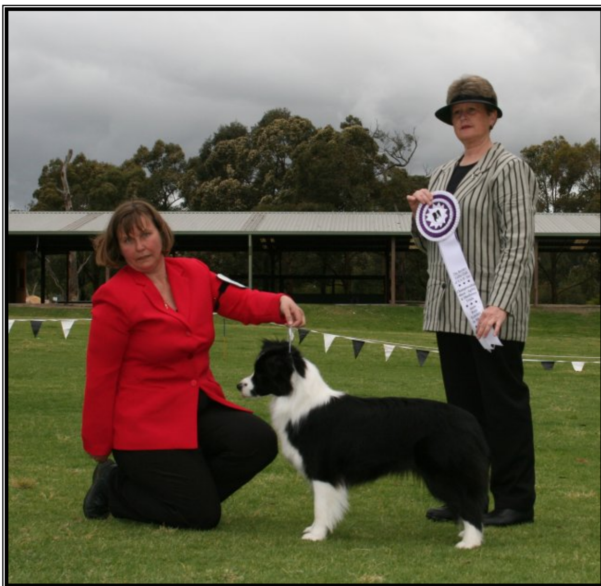
Ch Teyha Destiny All Over

Best In Show – Border Collie Club of NSW Championship Show October 2009