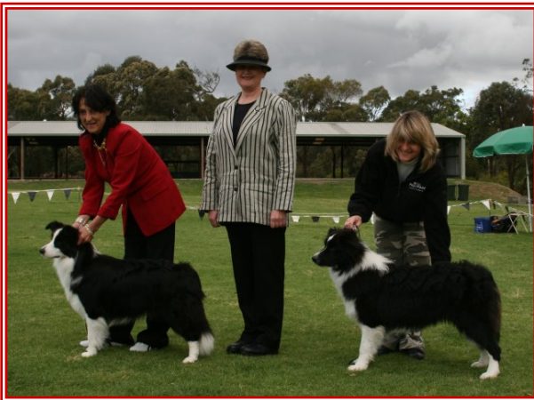
Tukonie To Cool For School - Etherial Adrenaline Rush