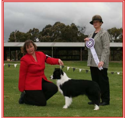
Ch. Tehya Destiny All Over

Well presented and shown in beautiful condition. It was my pleasure to award her first in the class, CHALLENGE BITCH and in a hotly contested runoff with the Challenge dog, BEST IN SHOW and BEST INTERMEDIATE IN SHOW .