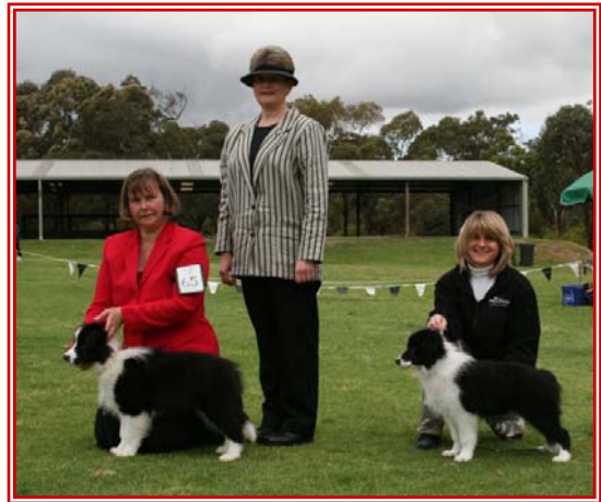
Tehya On The Money - Araluen Have I Told You Lately

Lovely breed type, a stand out in this class helped along by his aged of just 3 months. Black and white well balanced baby. Good head proportions, ears need to lift with age, oval shaped dark eye, displaying a keen and mild expression. Good length of neck into well-angulated forequarter, strong bone and oval shaped feet. Good length of back down to a gentle slope to the croup and set on of tail. Well-turned stifles and strong hocks. On the side gait, good length of stride, sound coming and going. Certainly one to watch in the future. I was very pleased to award him the class and BEST BABY PUPPY IN SHOW.