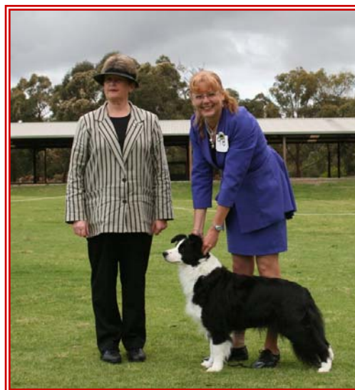
Ch Dancinvale Dare To Dream

9 year old bitch, well up to size. Good head and expression. Correct eye shape, mid brown in colour. Good ear carriage. Well boned, would prefer tighter feet. Good length of neck into withers. Well-angled forequarter and hindquarter, short hocks. Good body length and gentle slope off in croup. Shown in lovely condition and very well presented. I was pleased to award her the class and BEST NEUTER IN SHOW.