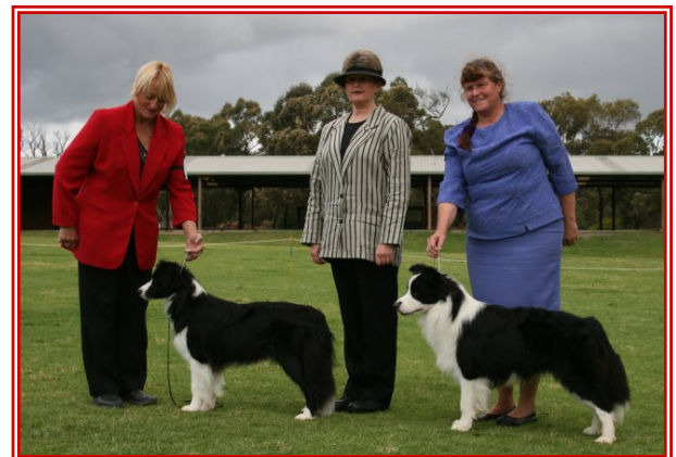
Tojess Gvme Diamonds N Luv - Ch Bordalace Day Dream Believer HT

16 months. Good head proportions, but would like more stop and more lift to the ears. Eyes correct shape, mid brown. Good length of neck into well angulated shoulders. Possibly a bit less length in the body, but will forgive this in a bitch. Gentle slope of croup, well turned stifles and short hocks. Excelled on the move, lovely long striding side gait. Still needs to body up a bit, but feel this will come with maturity. I was very pleased to award her the class and BEST JUNIOR IN SHOW.