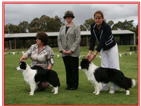
Nahrof Scattered Pages - Neecabe Heres Lookn Atu

6 month old well-angulated puppy, needs to drop in chest with maturity. Pretty head and correct shaped eye, dark in colour. Good length of body, well turned stifles and short hocks. Moved well. Unlucky to meet 1 st and 2 nd on the day.