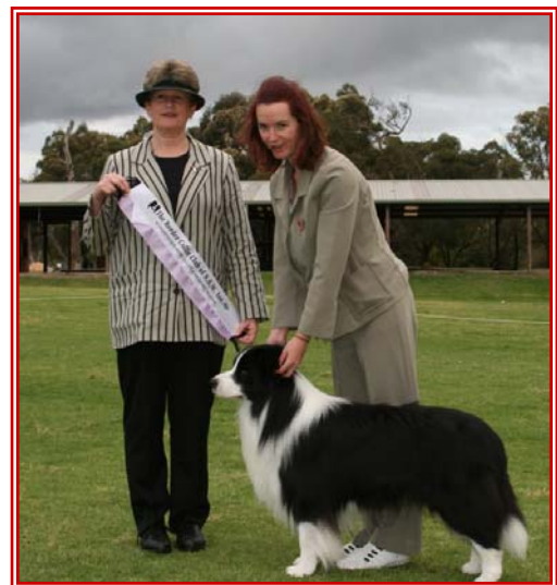
Ch. Danari Danceth Waves

Another masculine boy I liked, of good size and breed type. Strong head proportions, correct eye shape and colour. Would like to see a better ear carriage and a bit more length of neck to balance the profile. Strong bone, oval feet. Good depth of body and good spring of rib, correct body length, but would like more slope to the croup. Short thick hocks. Moved with good reach and drive, covering the ground well. Very well handled and presented. I was very pleased to award him the class, RESERVE CHALLENGE DOG and BEST OPPOSITE SEX AUSTRALIAN BRED IN SHOW.